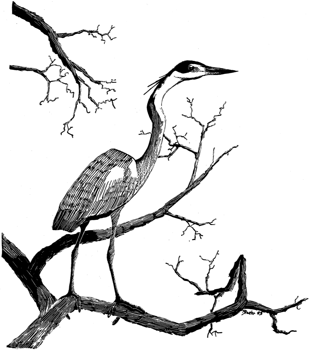
Black-headed Heron ( Ardea melanocephala )