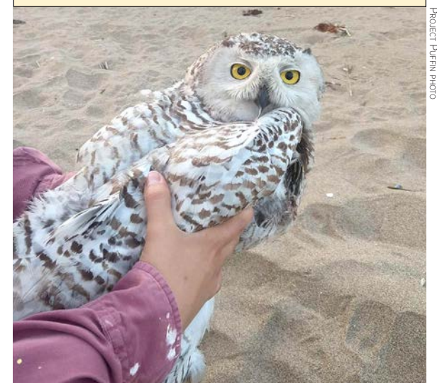
PROJECT PUFFIN PHOTO