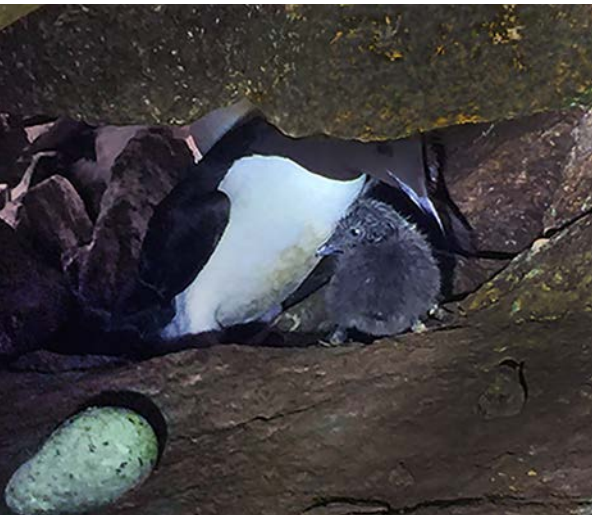
Common Murre and its chick in a boulder-crevice nest on Matinicus Rock—one of the first hatched on the island in over 130 years.