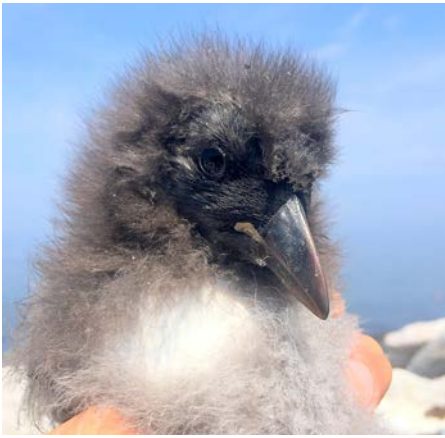
Puffin chick Grace on August 8 (left) before the food surge, and two weeks later, on August 21 (right). At 68 days old, Grace stayed in the burrow more than two weeks longer than normal, but the extended stay and longer-than-usual parental-care strategy seems to have paid off.

Food for puffin chicks became scarce when forage fish moved to deeper, cooler waters, or further north. Although puffins are capable of diving more than 200 feet, they usually feed in the upper 60 feet of