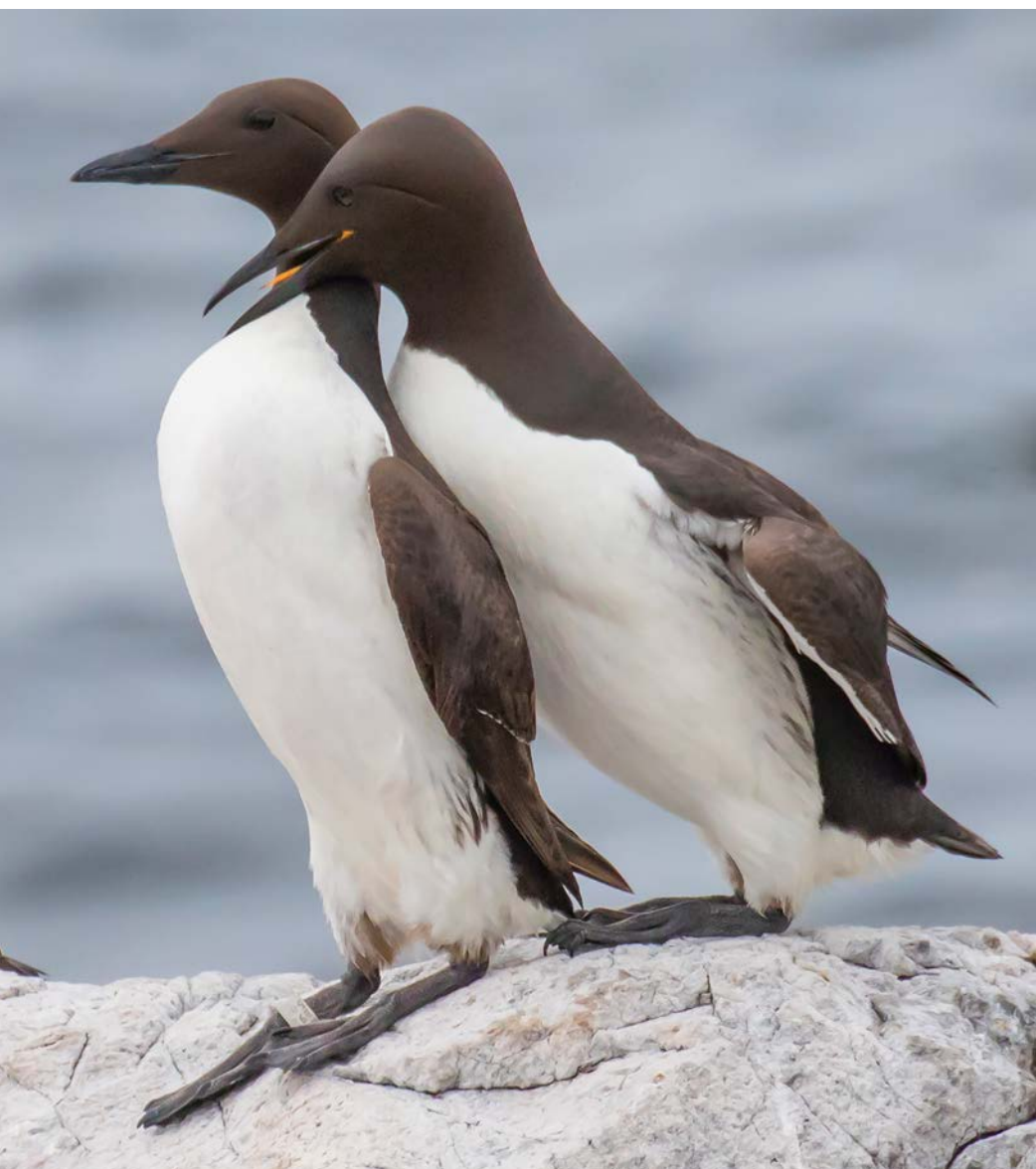
COMMON MURRES BY JEAN HALL

2003: Numbers of prospecting murres increase; murres nest at Machias Seal Island