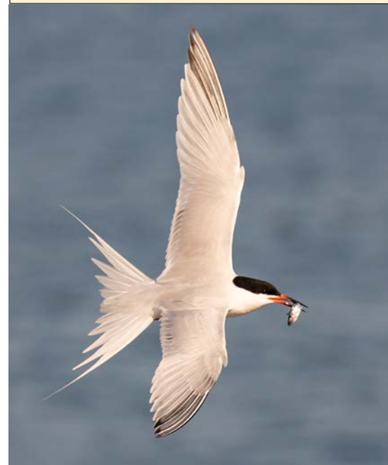
ROSEATE TERN BY JEAN HALL