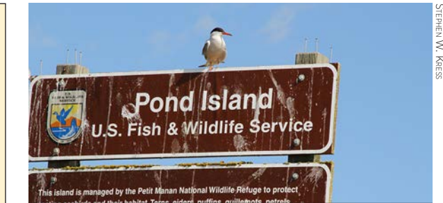
STEPHEN W. KRESS